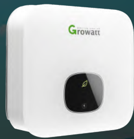
Residential on-grid inverters