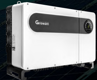
Large commercial and utility grade on-grid inverters