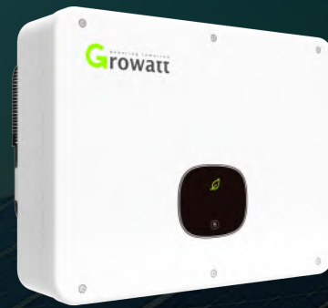
Commercial on-grid inverters