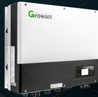
Residential storage inverters